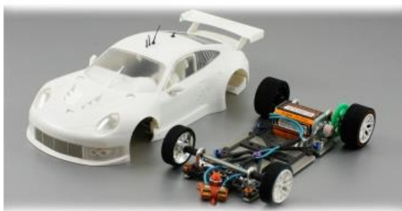
1/24 Porsche 991 GT3 RSR White Racing Kit SC-7047C Not assembled parts

(d) All of the chassis and body parts that come with the Scale Auto car as described in Art. 1.1.0. (a) must be used. See Rules-Pictures for additional clarification.