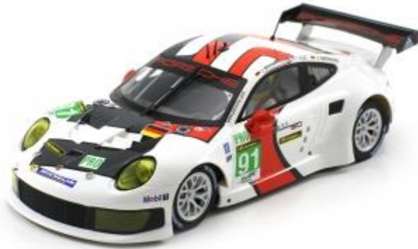
1/24 Porsche 991 RSR 24h Le mans 2013 #91 SC-7050R