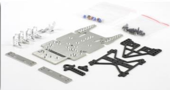
1/24 SC8003 GT3 Chassis Spare Parts with Carbon Fiber SC-8003C